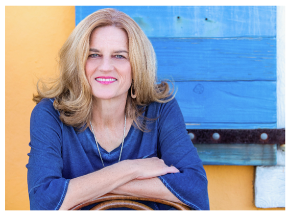
An update from Geni